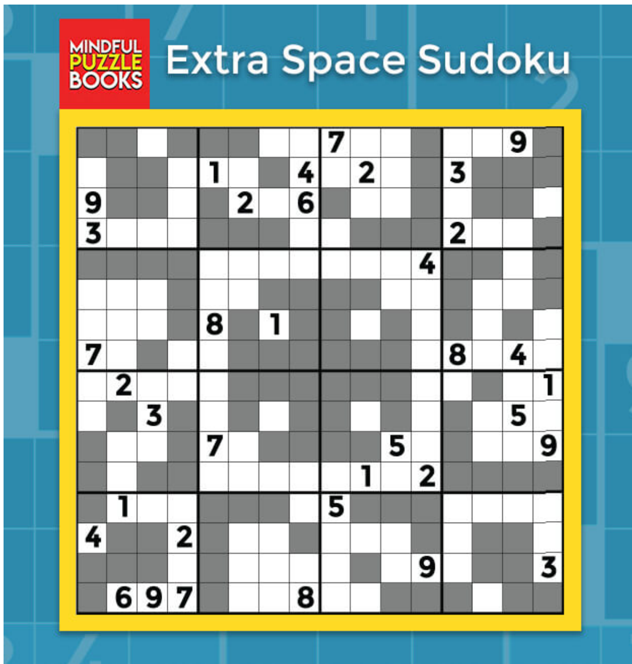
Extra Space Sudoku

Fill in the white cells so that 1-9 appears exactly once in each row, column, and bold region. The